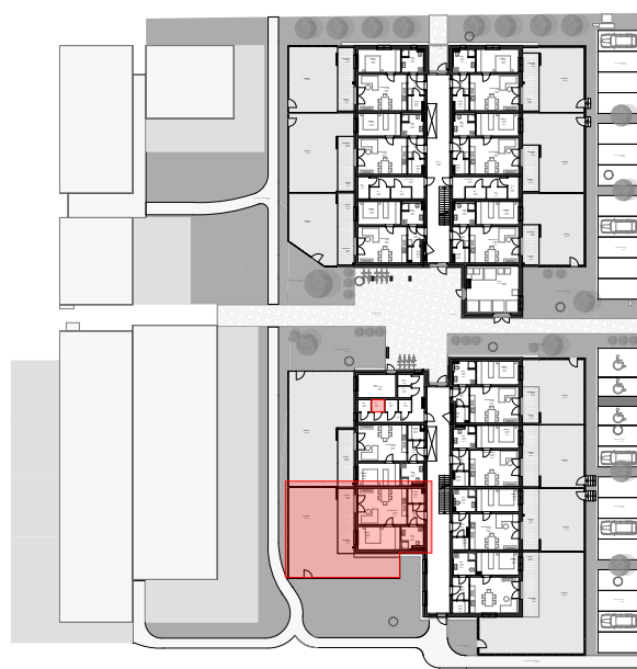
Übersichtsplan M 1:1000