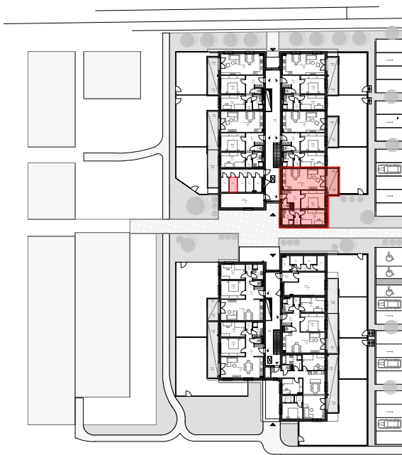
Übersichtsplan M 1:1000