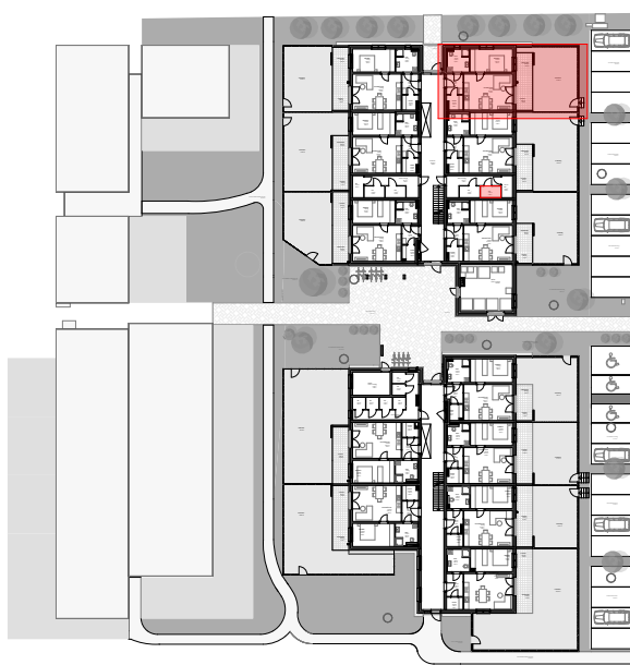
Übersichtsplan M 1:1000