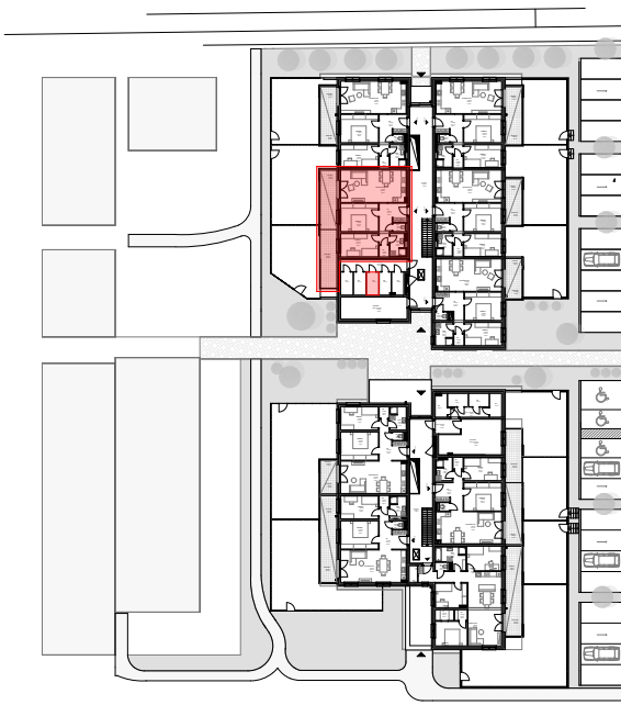
Übersichtsplan M 1:1000