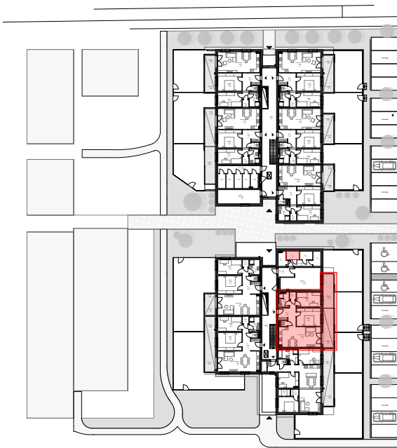
Übersichtsplan M 1:1000